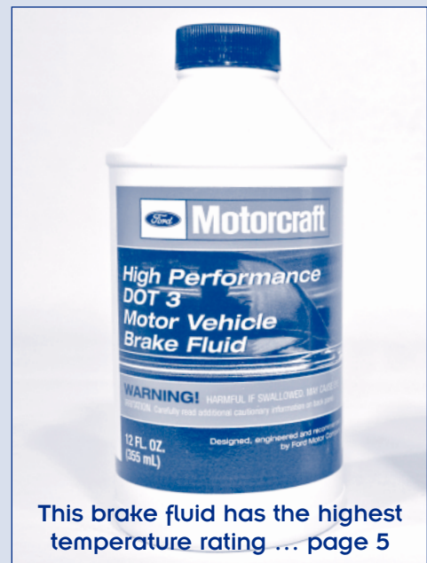
This brake fluid has the highest temperature rating ... page 5