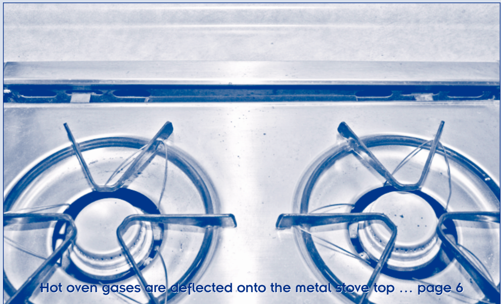
Hot oven gases are deflected onto the metal stove top ... page 6