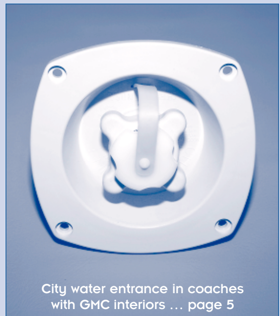
City water entrance in coaches with GMC interiors ... page 5