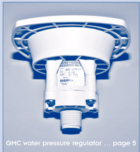
GMC water pressure regulator ... page 5