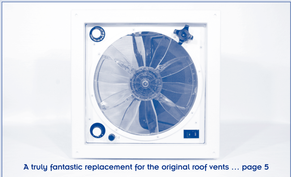
A truly fantastic replacement for the original roof vents ... page 5